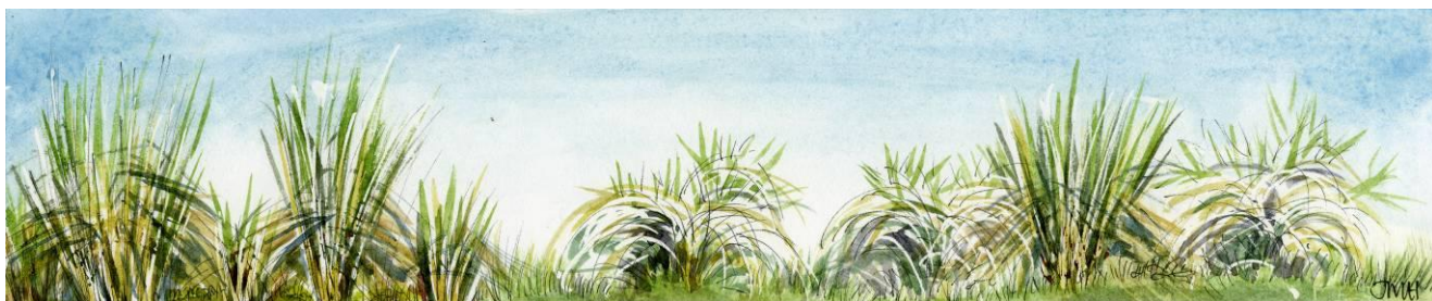
Cross section of ideal sward structure in the spring

Where rushes dominate, the average height should be about 13 cm with no more than 25% of the sward taller than 40 cm.