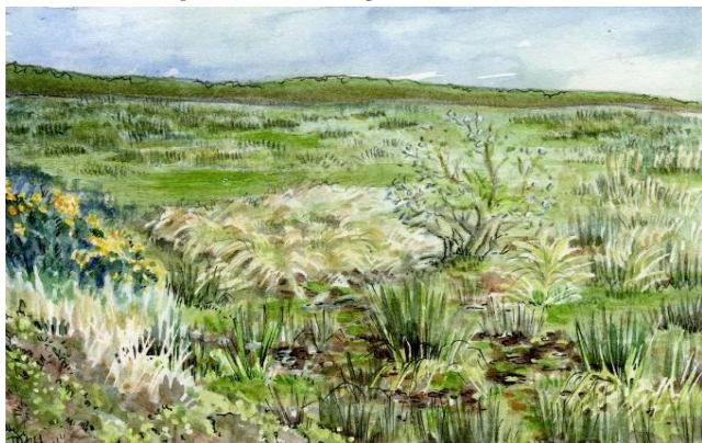
Too dense sward due to under-grazing