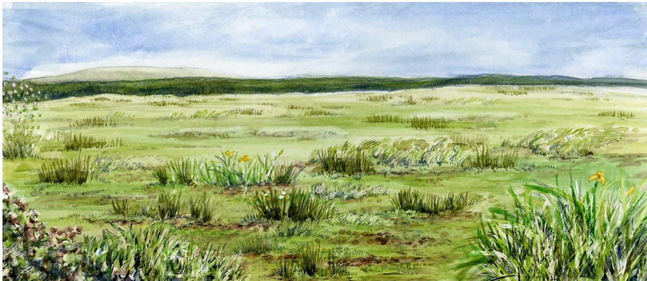
Ideal sward structure in April and May

Aim to create a diverse sward of shorter areas interspersed with taller tussocks.