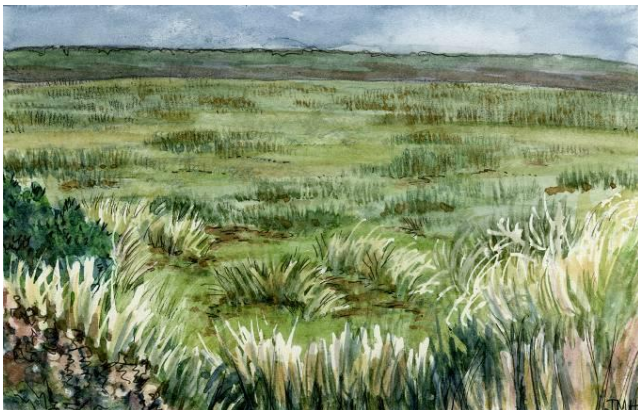
This sward is too dense