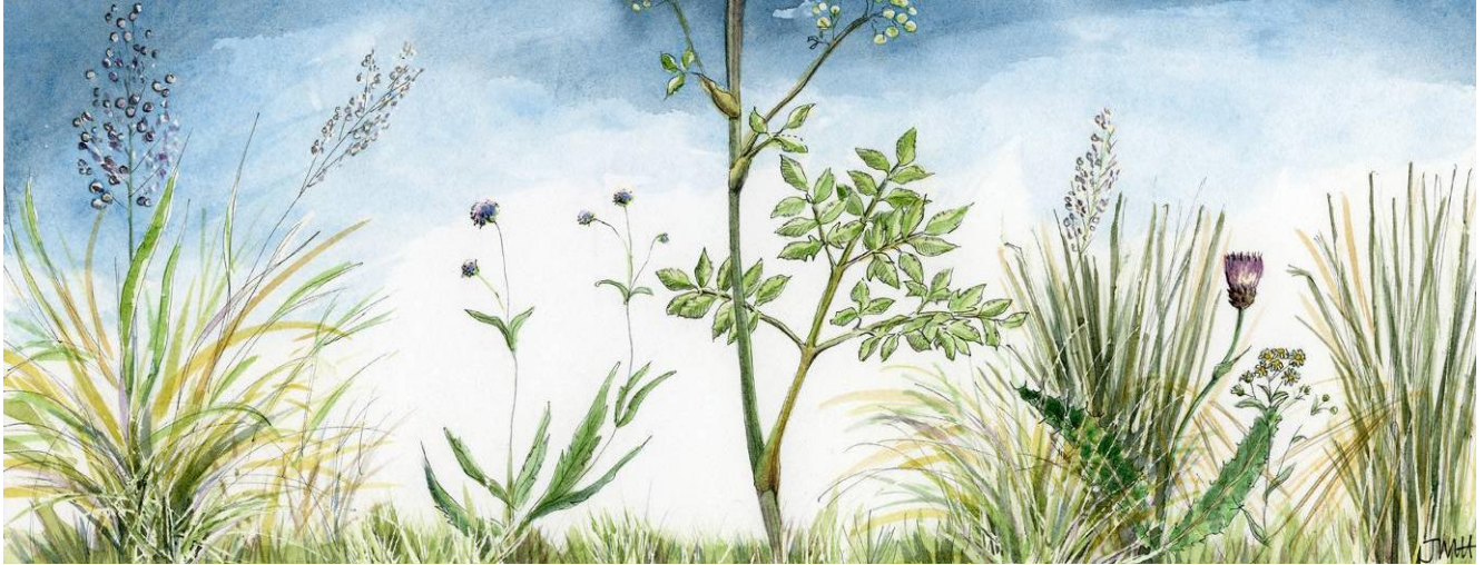
Purple moorgrass indicator species in September and October

In September purple moor-grass and late flowering plants such as devil-bit's scabious and meadow thistle may still be in flower and there may also be a few angelica and sneezewort flowers in bloom.