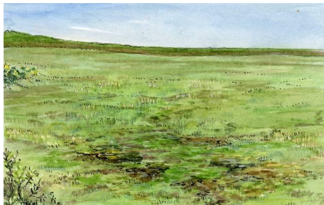
Sward too short due to over-grazing