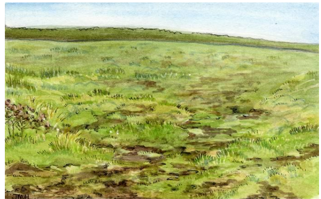
This sward is too short