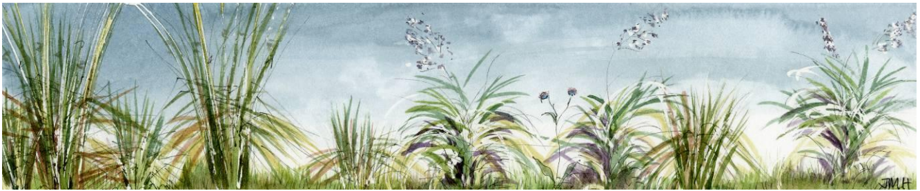
Cross section of ideal sward structure over winter