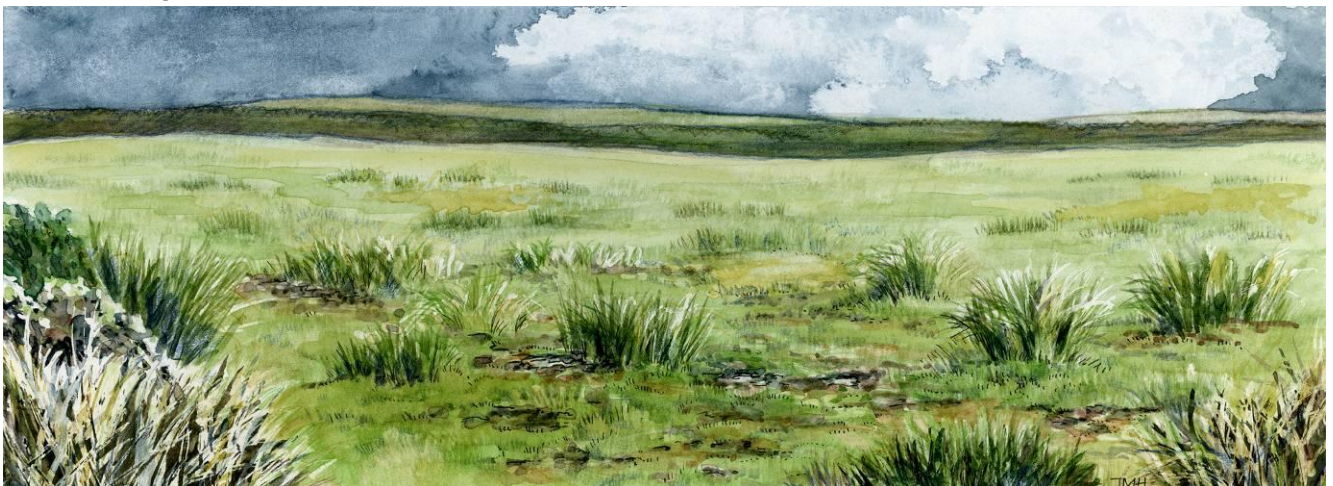
Ideal sward structure in the autumn

Where purple moor-grass dominates, the ideal average sward height is about 10 cm tall with no more than 25% of the sward taller than 15 cm, including rushes.